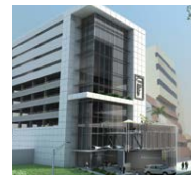
Torre F Valencia, Venezuela