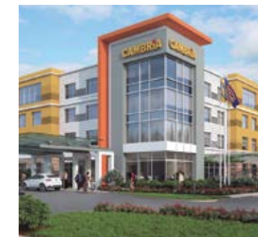
Cambria Houston, Texas