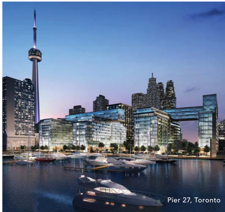
Pier 27, Toronto

Sabbia Beach will combine a spectacular location with luxurious amenities.