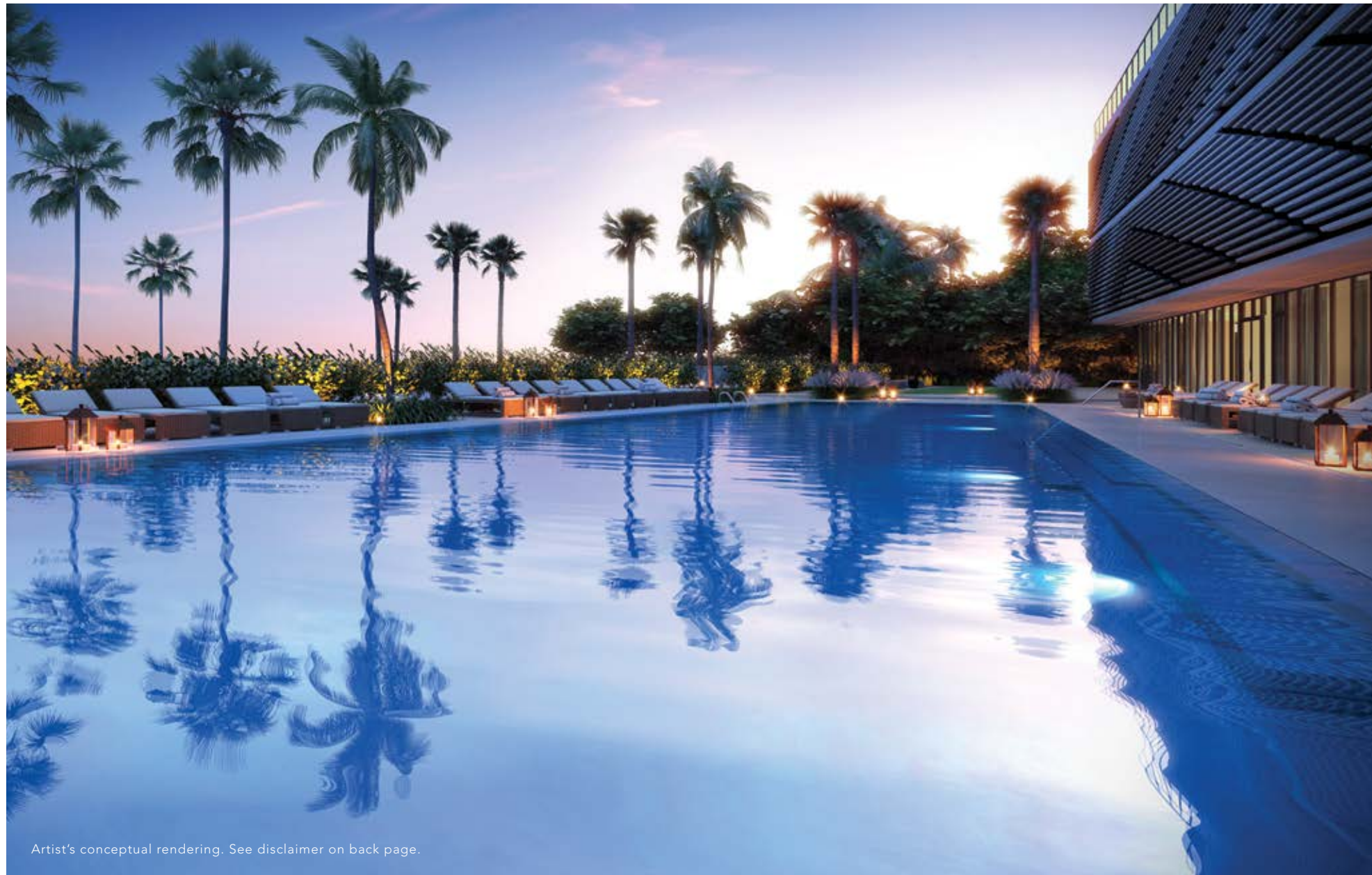
Artist's conceptual rendering. See disclaimer on back page.