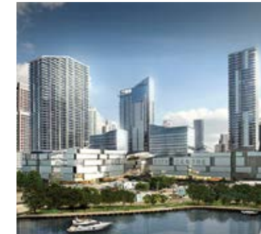
Brickell CitiCentre Brickell, Florida