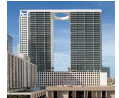
500 Brickell Condominium Miami, Florida