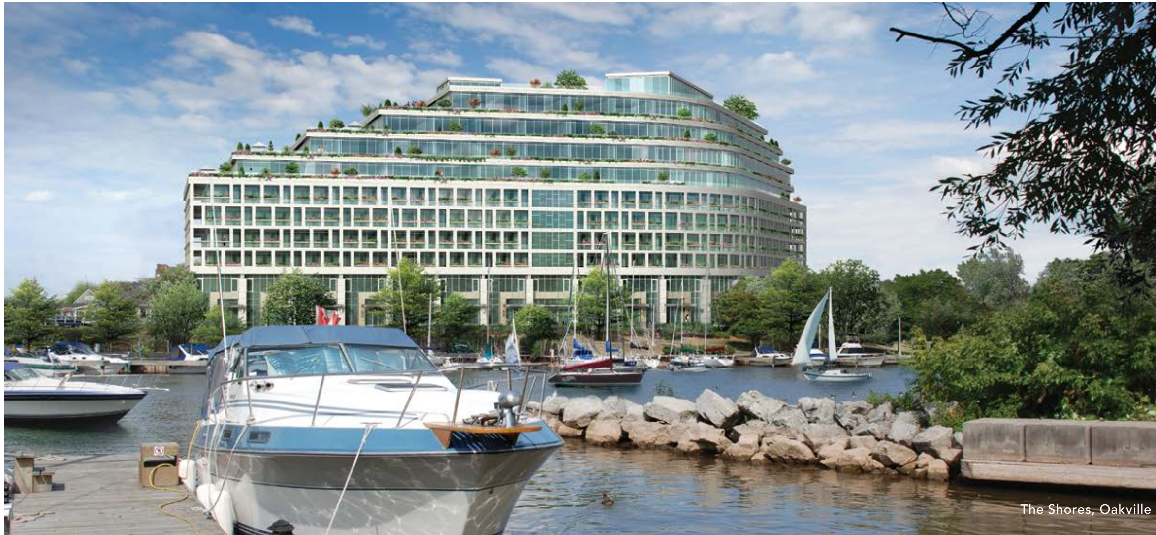
The Shores, Oakville