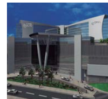
Galas Plaza Valencia, Venezuela