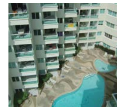
Varadero Viejo Tucacas, Venezuela