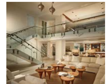
Ocean House South Beach Miami, FL