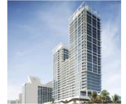
Canyon Ranch Hotel, Spa and Residences Miami Beach, Florida