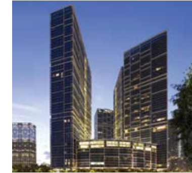
Icon Brickell Condominium + Viceroy Resort Miami, Florida

Well-known projects by Arquitectonica include the Microsoft Europe Headquarters in Paris, the Bronx Museum and Westin Times Square in New York, Festival Walk and the Cyberport Technology Campus in Hong Kong, the International Finance Center in Seoul, the headquarters of the Construction Bank and Agricultural Bank of China in Shanghai, the Mall of Asia in Manila, the Banco Santander Headquarters and W Torre Plaza in Sao Paulo, the US Embassy in Lima, the Infinity towers in San Francisco, the Hilton Americas in Houston, the Philips Arena in Atlanta and the AmericanAirlines Arena in Miami.