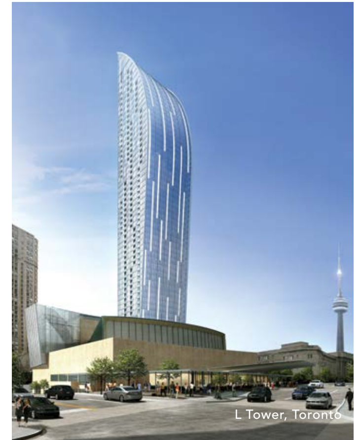
L Tower, Toronto