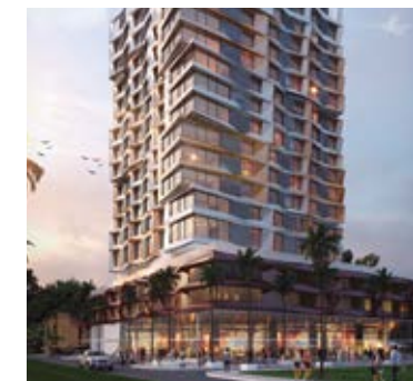
Cambria Brickell Miami, Florida