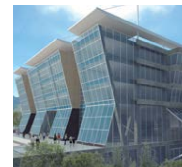
Torre Professional Valencia, Venezuela