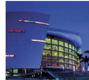
American Airlines Arena Miami, Florida

ArquitectonicaGEO works in close collaboration with clients, architects, planners, engineers, developers and construction professionals to create aesthetic and functional design solutions. The international, multi-disciplinary and multi-cultural richness of our firm provides the expertise to examine projects from all angles, and the agility to respond to changing issues of global concern.