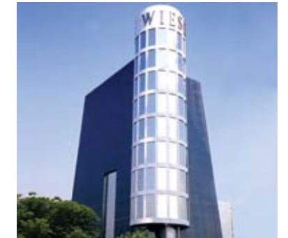
Banco Wiese Lima, Peru